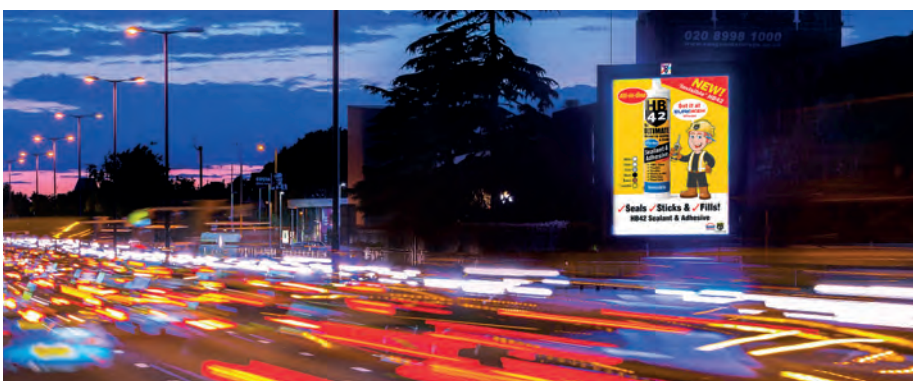
Digital Billboard Display Campaign - London

Professional Builder Magazine | Product Test 'Sticking Point' July 2016