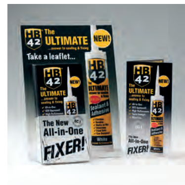
HB42 Stand: W 51cm H 81cm D 41cm Approx. x 120 Tubes per Stand