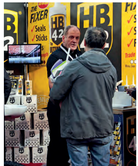
HB42 at Professional Builder Live

“...this stuff works, and these advanced polymer adhesives have a lot to offer!”