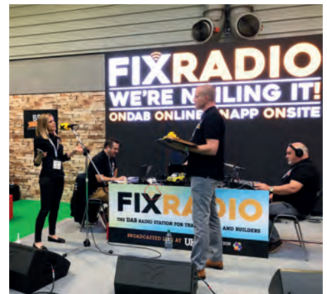
HB42 at Construction Week

real life building scenarios HB42 comes out on top - meeting the exacting standards of the construction industry in performance, health and safety, strength, speed and ease of use.